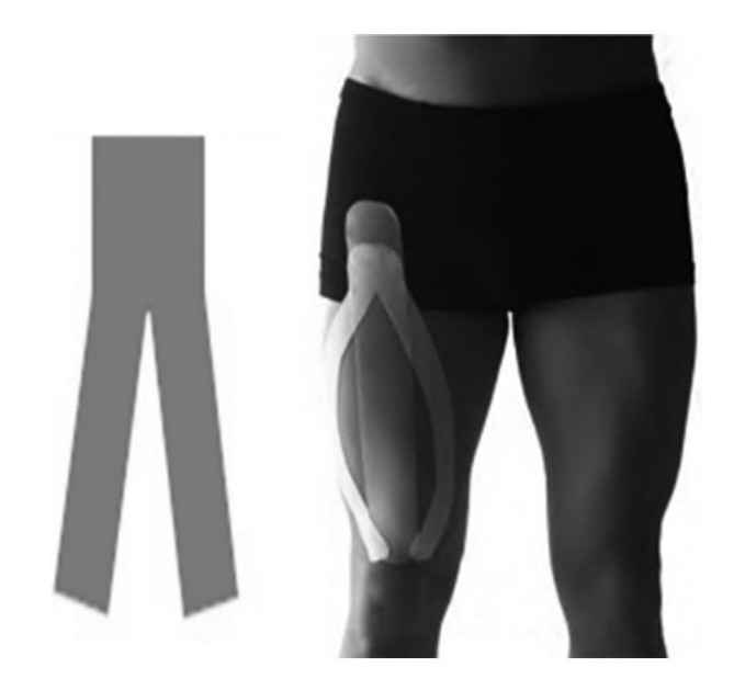
Figure 1. Demonstrative of applying kinesio taping with "Y" shape tape.

The bandage was beige, with a width of 5 x 5 cm, and applied from the source to the inclusion in the stretched